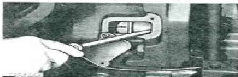
Fig. 5-Setting Engine to TDC