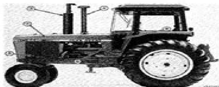
Fig. 13-Removing Muffler, Screens and Cowling