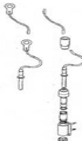
Conjunto cañón / piezoeléctrico