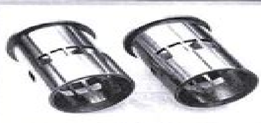
Standard Irvine 61 liner on left with piped liner; note latter's deeper exhaust ports.