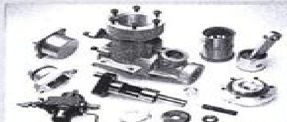
Parts of Irvine 61-RE. Engine uses investment casting for many components.