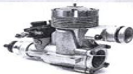
Nicely proportioned and sturdy looking, the 61-RE is largest, most powerful Irvine.