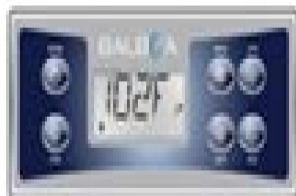
Balboa VL200 / VL400