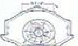
GM TH-400, 350, 295-48, 700R4, 3.80, 4.10, 4.60 Chevrolet