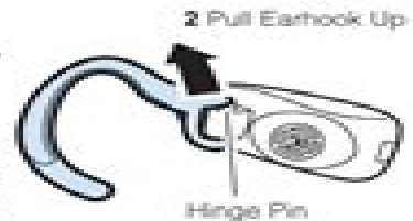
2 Pull Earhook Up