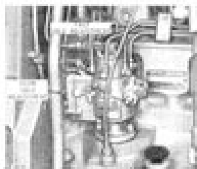
Fig. 9-D8 Injection Pump Adjustment

With the engine running at approximately 2500 rpm, turn the fast idle screw against the stop. Engine should be operating at specified speed.