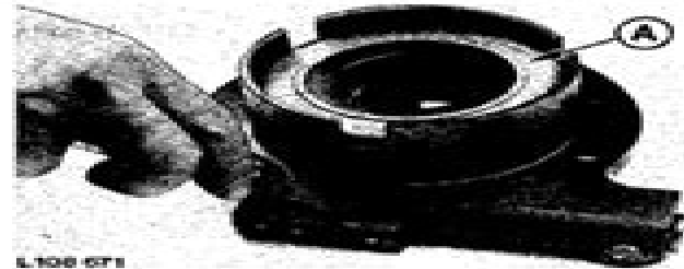
L 108 071

Press piston (A) out of housing with compressed air.