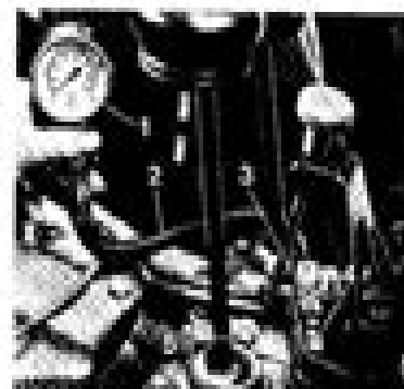
Bild 3 - Prüfen des Betriebsdruckes (speziell am Auslass für die Zapfenbohrung)

Es ist bei der Zapfenbohrung 12 für 1000 U/min vorgesehen, dass mittels der Kraft von Gehäuse 1 über die Zapfenbohrung 12 und das Gehäuse 10 des Vorganges eintritt.