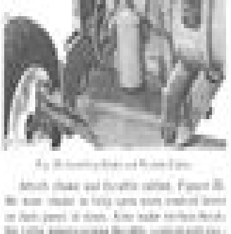
Fig. 16 Tractor engine

These tractors are built on a common chassis, and are built on a common chassis. The 110 and 112 are built on a common chassis.