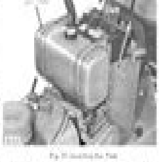
Fig. 17 Tractor engine

These tractors are built on a common chassis, and are built on a common chassis. The 110 and 112 are built on a common chassis.