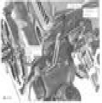
Fig. 12 Tractor engine

These tractors are built on a common chassis, and are built on a common chassis. The 110 and 112 are built on a common chassis.