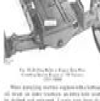
Fig. 14 Tractor engine

These tractors are built on a common chassis, and are built on a common chassis. The 110 and 112 are built on a common chassis.