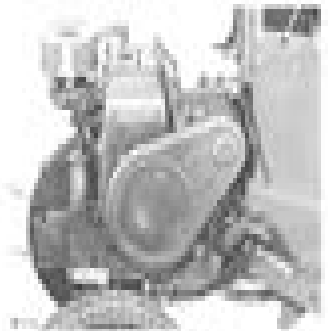
Fig. 13 Tractor engine

These tractors are built on a common chassis, and are built on a common chassis. The 110 and 112 are built on a common chassis.