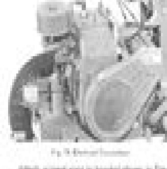
Fig. 15 Tractor engine

These tractors are built on a common chassis, and are built on a common chassis. The 110 and 112 are built on a common chassis.