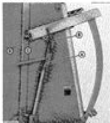
A—Gate Position Stop B—Cap Screws and Washers C—Spring