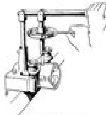
Fig. 19. Tightening the pole shoe retaining screws.