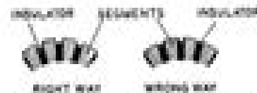
Fig. 18. Showing the correct and incorrect ways of undercutting the commutator insulator.