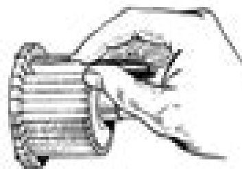
Fig. 17. Undercutting the commutator insulator.

Clean the commutator with a petrol-volatile cloth. If this is ineffective, carefully polish with a strip of fine glass paper while rotating the commutator. To remove a badly worn commutator, mount the commutator, with or without drive and friction, in a lathe, rotate at high speed and take a light cut with a very sharp tool. The run must be more exact than is necessary. Polish the commutator with a very fine glass paper. Emery cloth must not be used on the commutator. Undercut the insulators between the segments to a depth of \frac{1}{8} " with a hack saw blade ground to the thickness of the insulator.