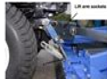
Fig. 2 Rotary Deck Mounting Plates