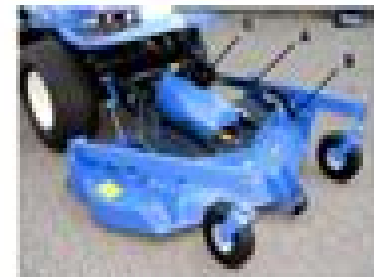
Fig. 1 LIFT arms