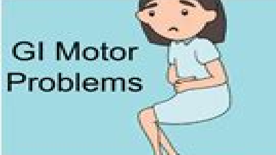
GI Motor Problems