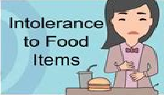
Intolerance to Food Items