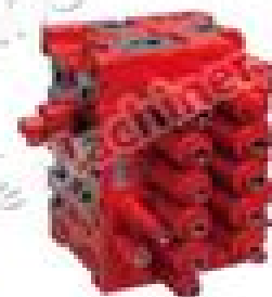
3.3 Main Control Valve