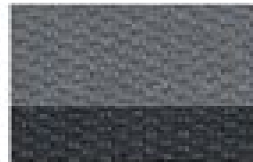
Medium Dark Flint Cloth