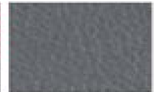
Medium Dark Flint Leather