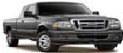
Dark Shadow Grey Metallic