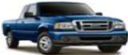
Viola Blue Metallic