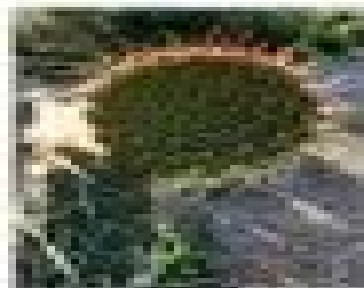
spines on a cactus