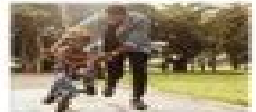
riding a bicycle