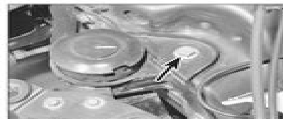
20.22 Left-hand engine mounting body bracket bolt

the transmission using a trolley jack and piece of wood.