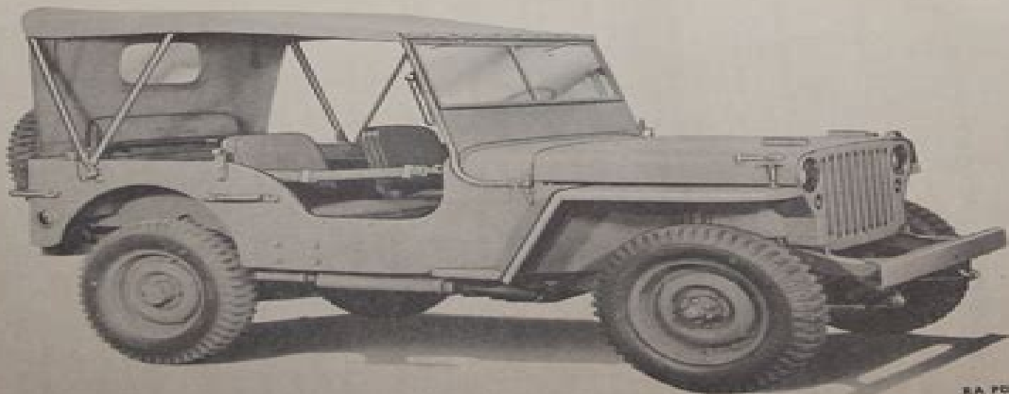
Figure 3—1/4-Ton 4 x 4 Truck—Right Side