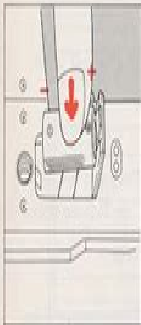
1. Insert battery. (P.10)