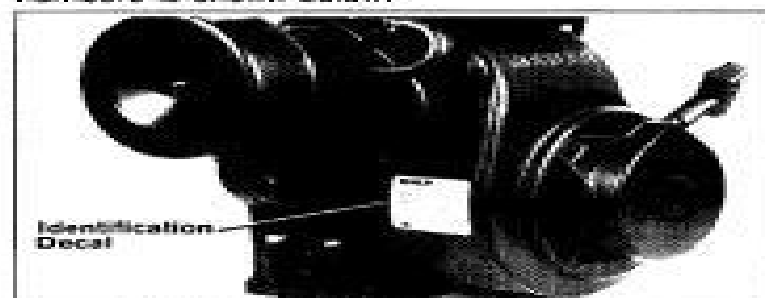
Figure 1-1. Location of Engine Identification Decal.