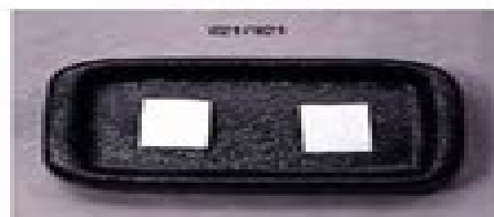
HOLDER REMOTE CONTROL BLACK, ABS 3.25X5.66X.88