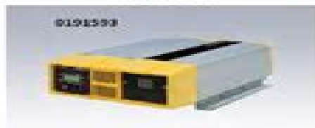
INVERTER 1800 WATT PUR SINE WAVE