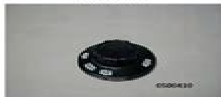
KNOB BURNER VALVE #9 (FOR OUTSIDE GAS GRILL 914-1847)