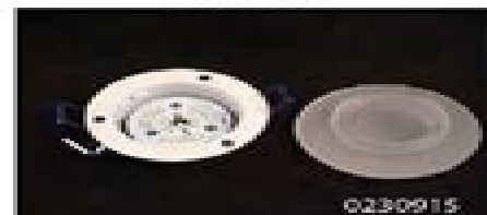
LIGHT CEILING LED RECESSED 3" DIAMETER 3160K WITH LENS AND SPRING CLIPS STYLE 04-110WV