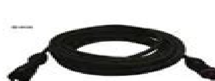
HARNESSE CAMERA WITH ASA 15 CONNECTOR