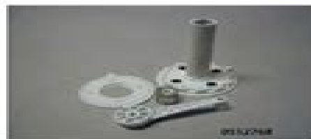
HARDWARE KIT TV ANTENNA WHITE