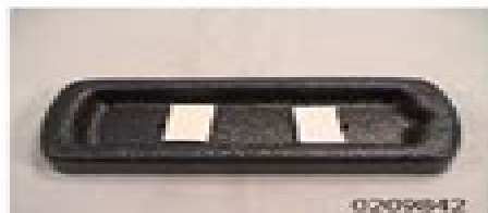
HOLDER REMOTE CONTROL BLACK, 2.25X5.66X0.5 ABS