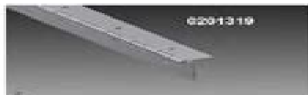
HINGE PLANO 1X150X800 ALUMINUM OFFSET