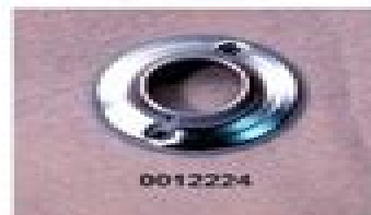
HOLDER CLOSET ROD ROUND CHROME