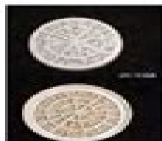
GRILL SPEAKER WHITE 5-1/4" ROUND