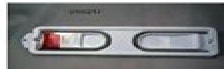
HOLDER PAPER TOWEL WHITE PLASTIC