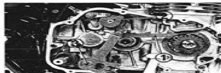
Fig. 4-63 (1) Gearshift arm (2) Gearshift drum (3) Gearshift spindle