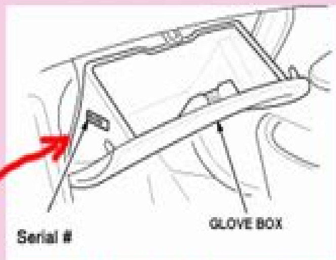
Sticker on the outer-left surface of the glove box