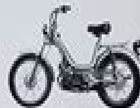
Fig. 1. Motore a 2 tempi

Struttura motore a 2 tempi a 2 tempi a 2 tempi