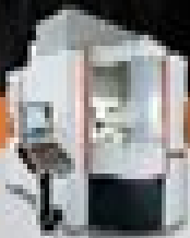
Model HSM 100