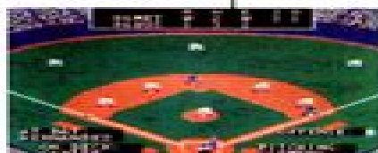
Natural vs. Artificial Turf

We made it even better! MicroLeague Baseball II goes beyond the first edition, with phenomenal new visuals and sophisticated features such as: stadium dimensions, grass and artificial turf factors, box score and stat compiler built in , so you can keep track of your players and their season ■ expanded statistical factors if you're a baseball purist ■ injuries, arguments with the ump and even rain delays. Plus a "Quick-Play Option", if you like to get to the bottom of the ninth inning fast .