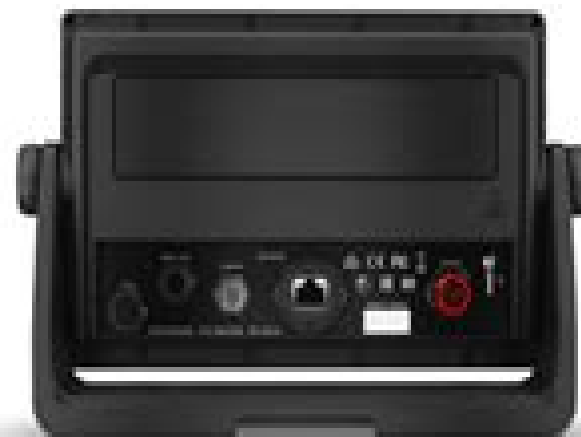
Rear of Modern MFD with NMEA 2000