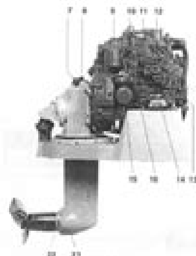
MD2010B & MD2020B