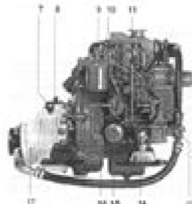
MD2010B & MD2020B