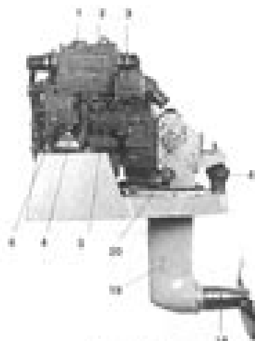
MD2010B & MD2020B