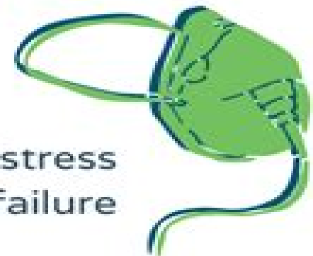
Resp. distress vs. failure