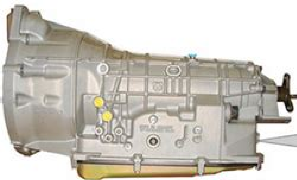
Example: 4 Speed and early 5 Speed transmissions