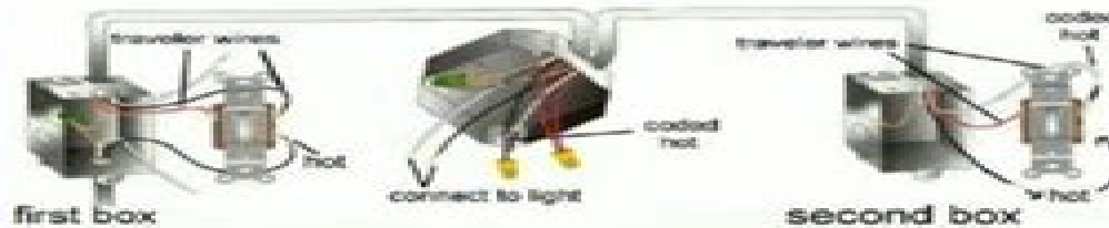
3-way switch with light at end