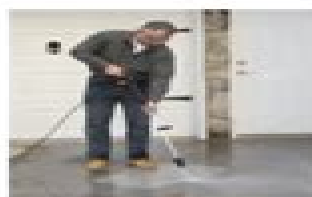
Clean a Driveway

The G 3050 OH is equipped with a reliable, easy to start 187cc HP Honda GC 190 engine and a full set of our patented Pro-Style nozzles. A full line of accessories is available to further enhance the capabilities of this exciting new pressure washer. Elevate your level of cleaning today with the G 3050 OH from Kärcher!