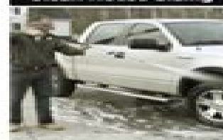
Clean a Vehicle