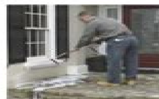
Clean House Siding