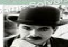
Charlie Chaplin Charlie Chaplin