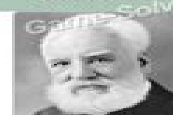
Alexander Graham Bell Alexander Graham Bell