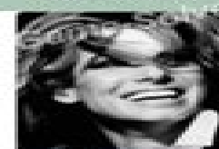
Sandra Bullock Sandra Bullock