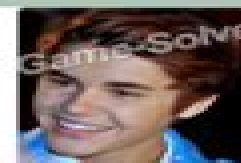
Justin Bieber Justin Bieber