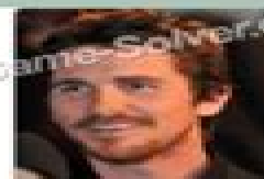
Gareth Bale Gareth Bale