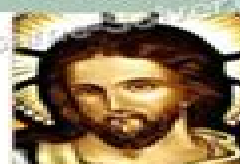
Jesus Christ Jesus Christ