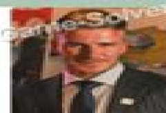
David Beckham David Beckham