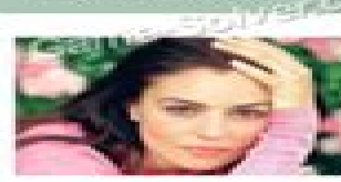
Monica Bellucci Monica Bellucci