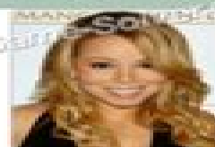
Mariah Carey Mariah Carey