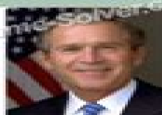
George W. Bush George W. Bush