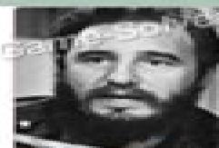
Fidel Castro Fidel Castro