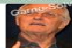
Alan Alda Alan Alda