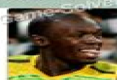
Usain Bolt Usain Bolt