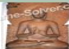
Buddha Quotes Buddha Quotes

by http://game-solver.com/ updated: 2014-04-24 Version 1.0