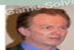
Tony Blair Tony Blair