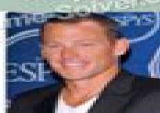
Lance Armstrong Lance Armstrong