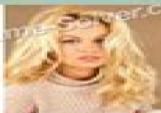
Pam Anderson Pam Anderson