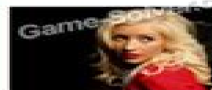
Christina Aguilera Christina Aguilera