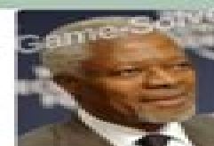
Kofi Annan Kofi Annan