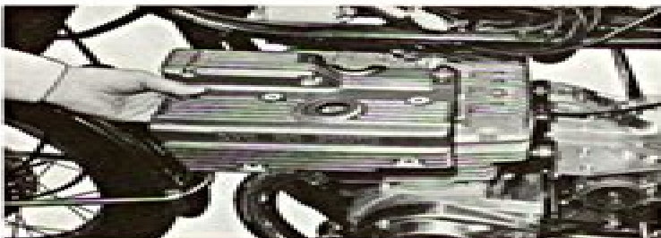
Fig. 7-1-21 Removing cylinder head covers