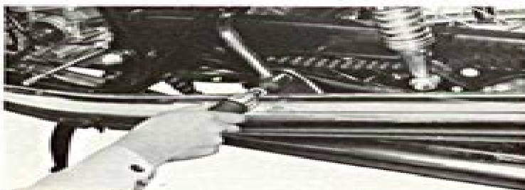
Fig. 7-1-22 Removing rear footrest