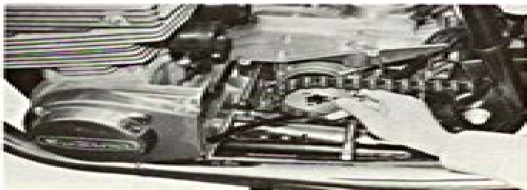
Fig. 7-1-20 Removing drive sprocket