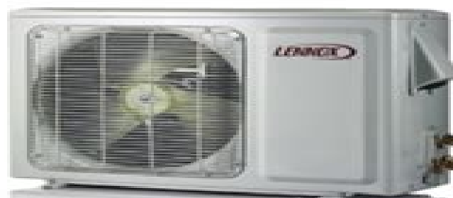
MS8-CO Air Conditioner Outdoor Unit MS8-HO Heat Pump Outdoor Unit