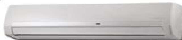
MS8-CI Air Conditioner Indoor Unit MS8-HI Heat Pump Indoor Unit

Bulletin No. 210632 September 2013 Supersedes June 2013