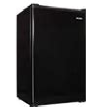
Haier 2.7 cu ft Refrigerator, Black