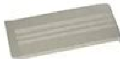
Haier RF-2300-93 DOOR - EVAPORATOR