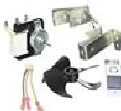
MOTOR - EVAP (KIT)