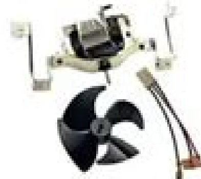
Haier RF-4550-33 Evaporator Motor Kit for Refrigerator