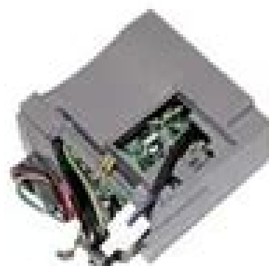
Haier RF-5210-15 P.C.B. Compressor Inverter