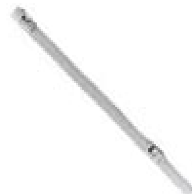
Mullion - RF Door