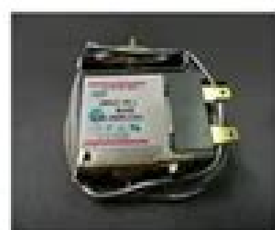
Haier RF-7350-82 Thermostat -