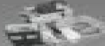
4-axis vertical swing table - 6000