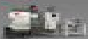
4-axis vertical swing table - 4000