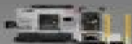
4-axis vertical swing table - 8000