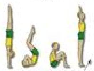
Handstand forward roll