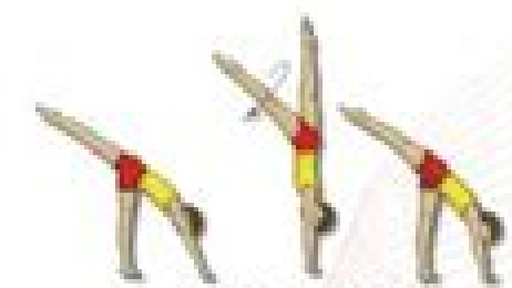
Change leg handstand