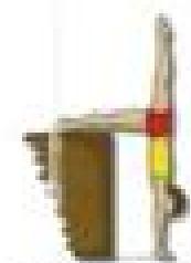
Moving toward handstand using apparatus