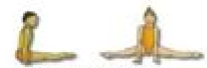
Half lever or straddled half lever