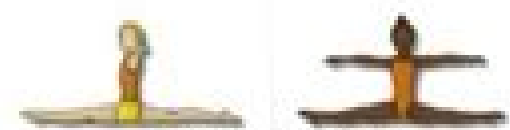
Front splits or Side splits