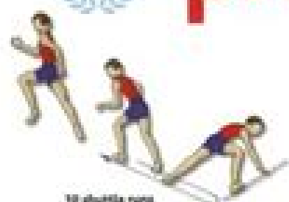
10 shuttle run