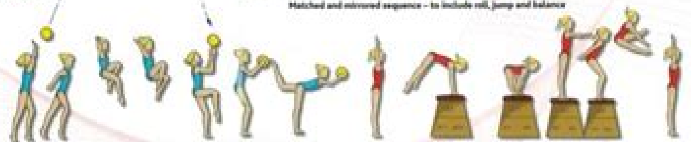
Throw hand apparatus, perform a leap, catch and perform a balance