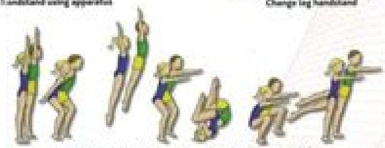
Matched and mirrored sequence - to include roll, jump and balance