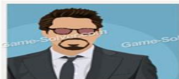
Robert Downey Jr