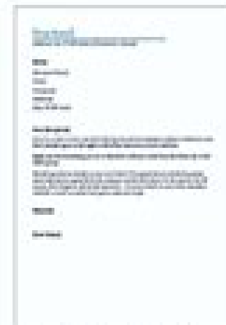
Resume cover letter Word FREE