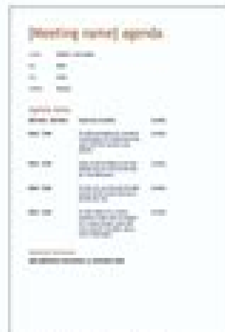
Business meeting agenda (Orange design) Word FREE