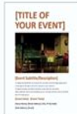
Event flyer Word FREE