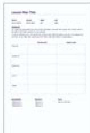
Daily lesson planner