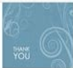
Thank you cards