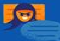
Text message spoofing