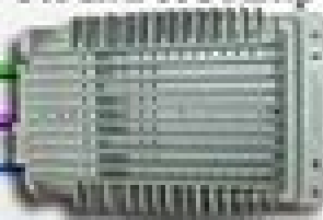
Stock Bose Amp