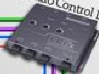
Audio Control LC6i