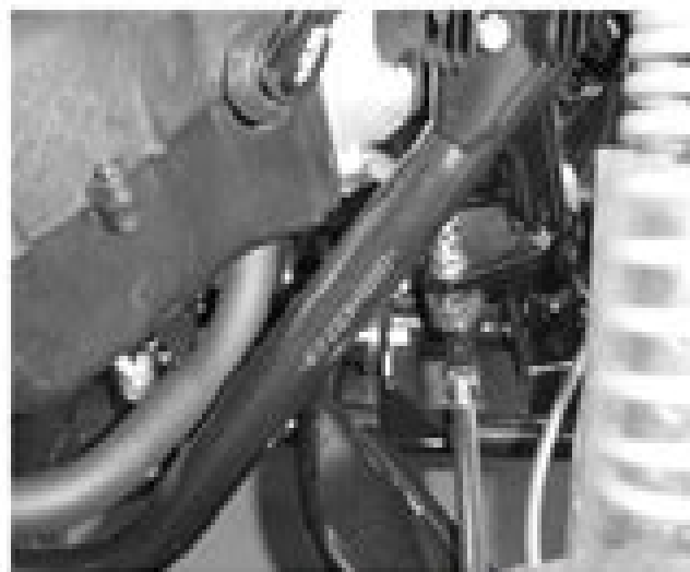
RXL / EXL150 (Viper. St)