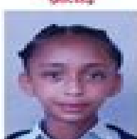
Bitaniga Yehuala 95.3