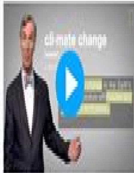
All About Climate Change