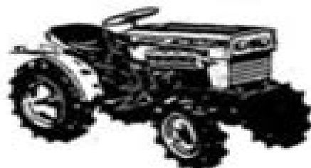
4YM135D Wheel Drive