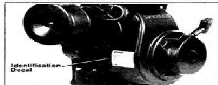
Figure 1-1. Location of Engine Identification Decal.